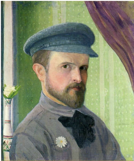
Self Portrait, 1909/10.